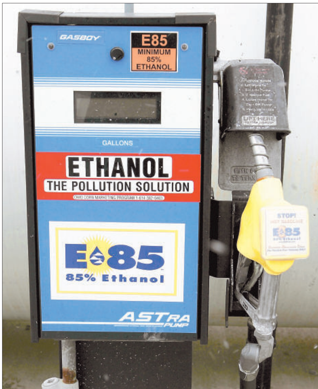
An E85 pump offers the ethanol-based fuel at the Ohio Department of Agriculture in Columbus. E85 consists of 85 percent ethanol and 15 percent refined petroleum. While the ethanol industry is booming, the fuel faces an array of challenges. See page E-4.